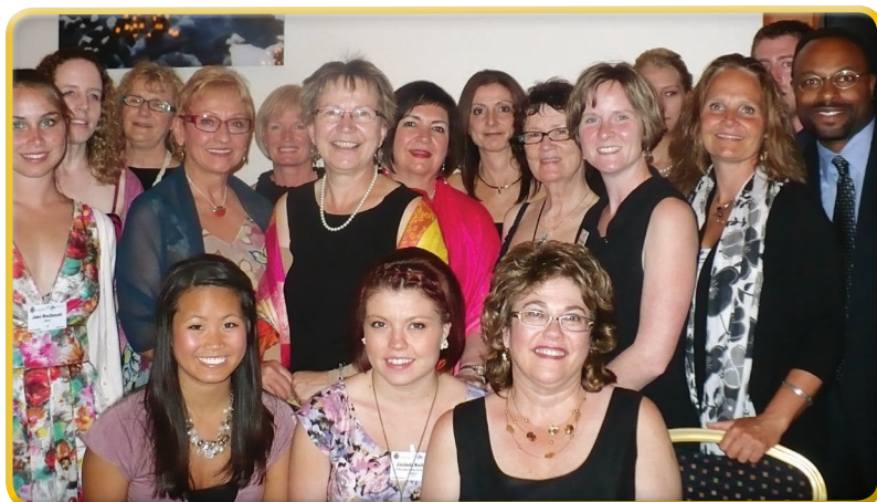
▲ Some of the Canadian delegates at the ISDH.

Sessions over a three-day schedule, ranged in variety from the oral systemic link to periodontal pocket access issues, and almost any other topic that would intrigue a dental hygienist. Equally interesting were the poster presentations from fellow dental hygienists who displayed the