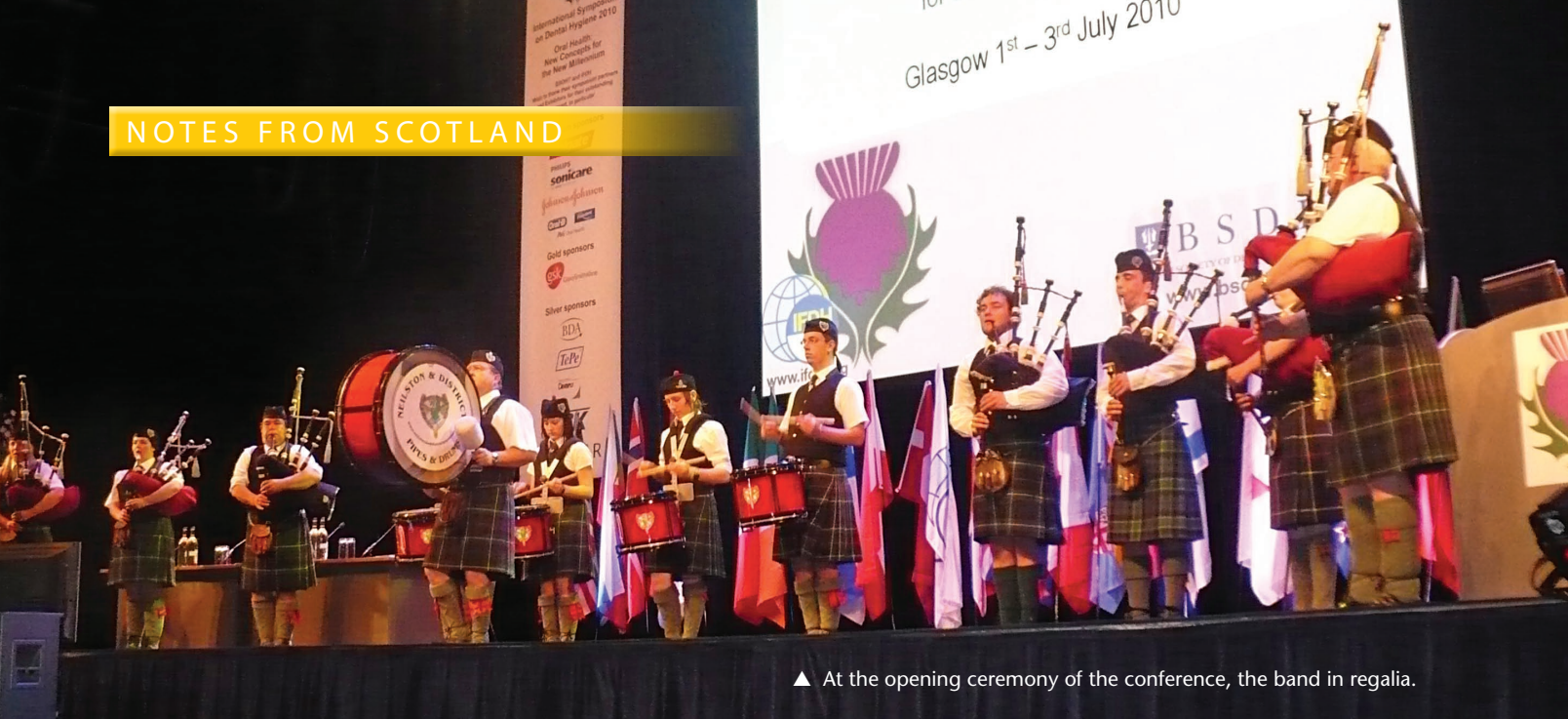
▲ At the opening ceremony of the conference, the band in regalia.